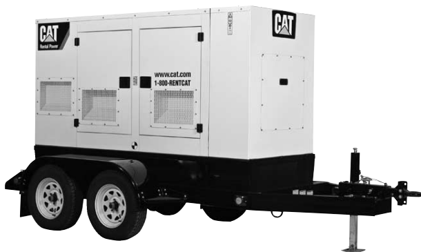
Picture shown with optional trailer