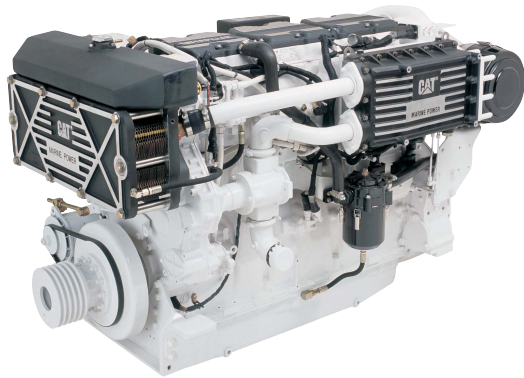
Image shown may not reflect actual Engine