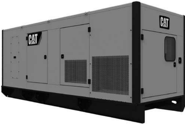
Picture shown may not reflect actual package.