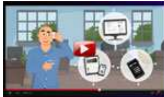
Sell Your Equipment Video