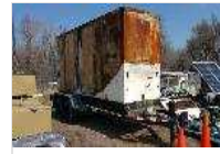
Caterpillar XQ400-C15 Generator Set

Athabasca, AB, CAN Time Left: Lot In Preview