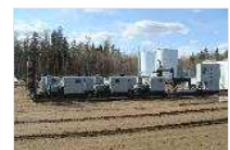
Six Pac Generator