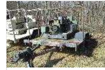
1989 Libby Corporation MEP 003A Generator Set

Athabasca, AB, CAN Time Left: Lot In Preview