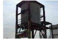
80 Metric Ton Heated Cement Mixer / Bulk Hopper

Evans, CO, USA Time Left: Lot In Preview