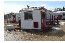
Generator 208 Volt w/ Arrow VRG 220 Engine Skidded & Housed

Athabasca, AB, CAN Time Left: Lot In Preview