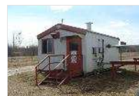
Skidded House w/ 208