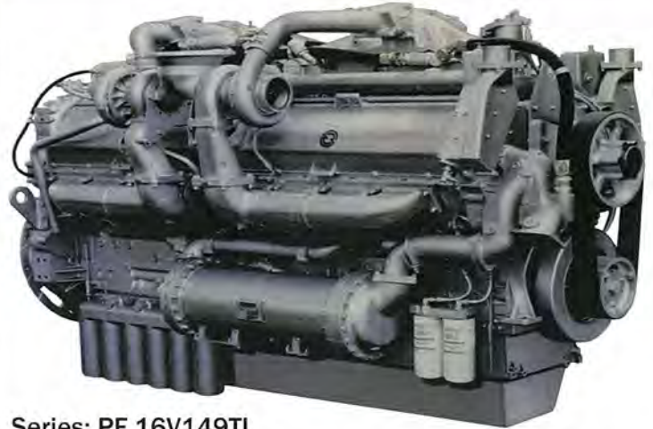
Series: PF 16V149TI

POWERFORCE® has a fair no hassle exchange program for engine cores.