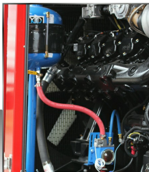
5 to 16 gallon oil reservoir with site glass regulator