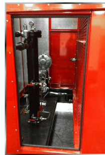
Vertical Fuel Scrubber with Auto Dump & Safety Shutdown