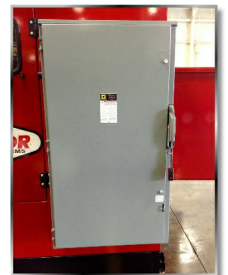
NEMA 3R Disconnect Box