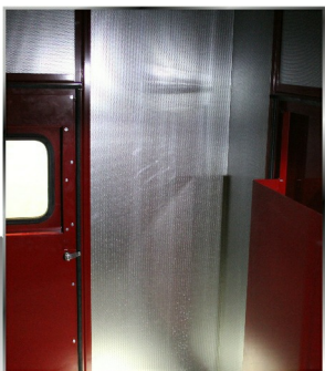
2" thick Roxul wool insulation with Galvanneal perf liner