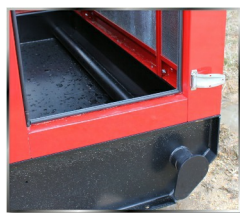
Teardrop Lifting Points extend full frame