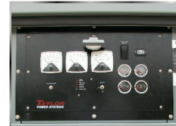
Analog Control Panel