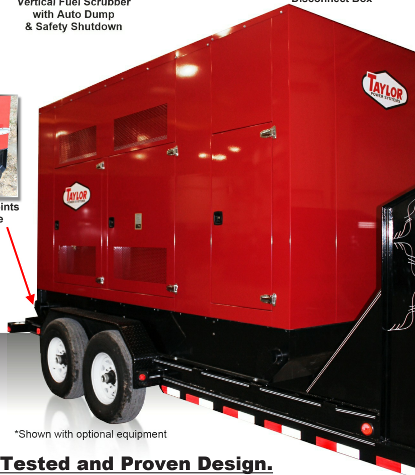
*Shown with optional equipment