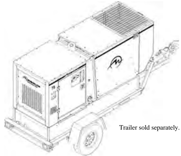
Trailer sold separately.